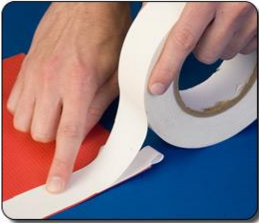
Apply PowerTape ® 1 min