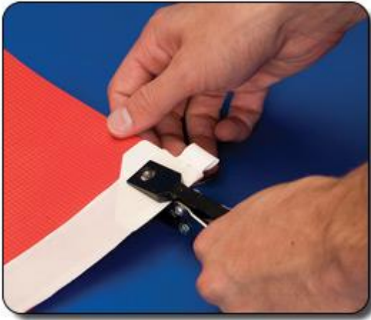
Punch Hole 1 min