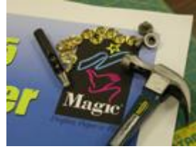
Punch & Grommet 10 min