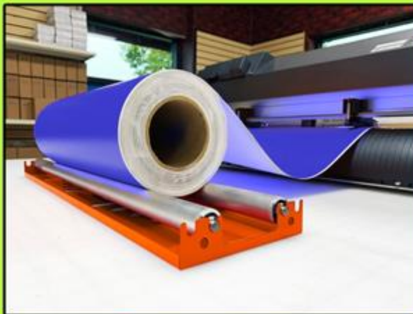
▶ MEDIA ROLLS