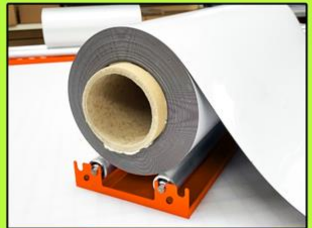
▶ MAGNETIC ROLLS