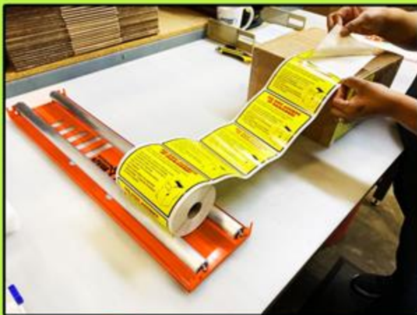
▶ STICKER ROLLS